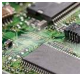
Thickness measurement of conformal coating in submicron range.