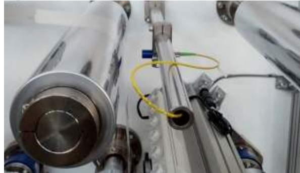
Measuring the thickness of multilayer plastic foils

The DLL developed by Precitec Optronik provides an universal interface for integrating CHRocodile devices. For specific sensor requirements, feel free to contact us regarding a customized solution.