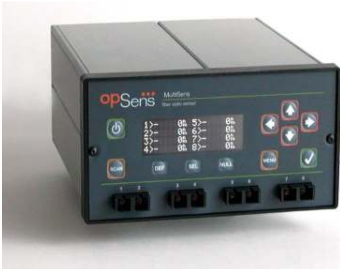
MULTI-CHANNEL, MULTI-PURPOSE SIGNAL CONDITIONER FOR LABORATORY APPLICATIONS

Use with Opsens' WLPI fiber optic sensors — • Pressure • Temperature • Strain • Position