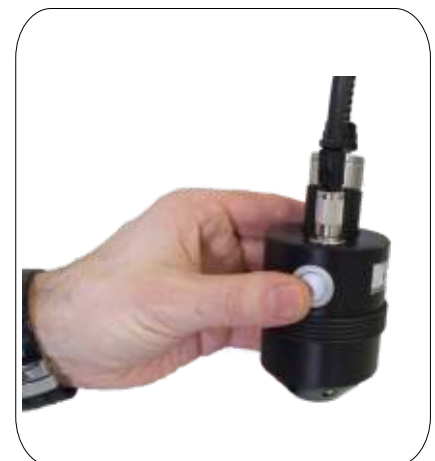
d/8° Messkopf Adapter